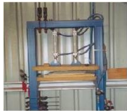
The Finished box! No that's Tony's vacuum press.....Stayed tuned for photos of finished boxes.