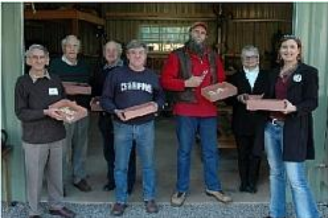
Day 1 – the class made the base of the box