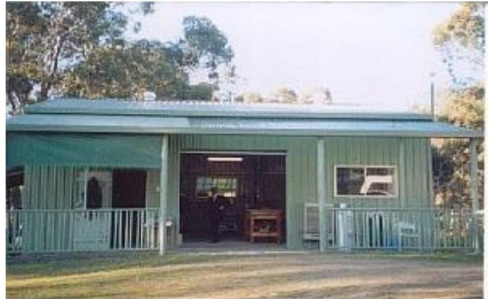
Tony's fantastic workshop in Harcourt