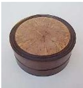
African Blackwood 50 x 30mm $85