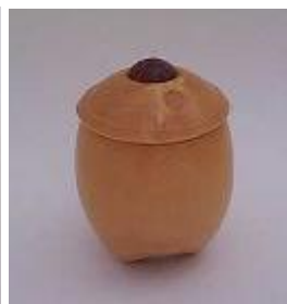
English Box 60 x 90mm $100