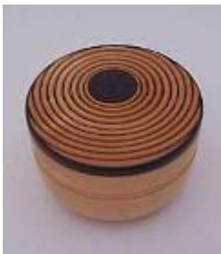
English Box & Ebony 65 x 40mm $85