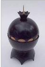
Ebony & Pink Ivory 70 x 90mm $250