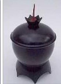
Ebony & Pink Ivory 100 x 60mm $350