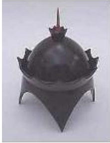
Ebony & English Box 100 x 60mm $500