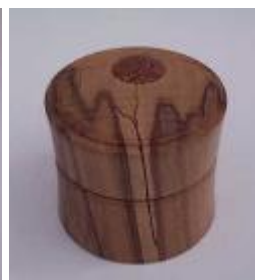
Spalted Beech 55 x 60mm $85