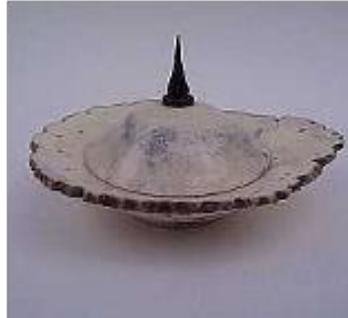
Ambrosia Burl 65 x 40mm $85